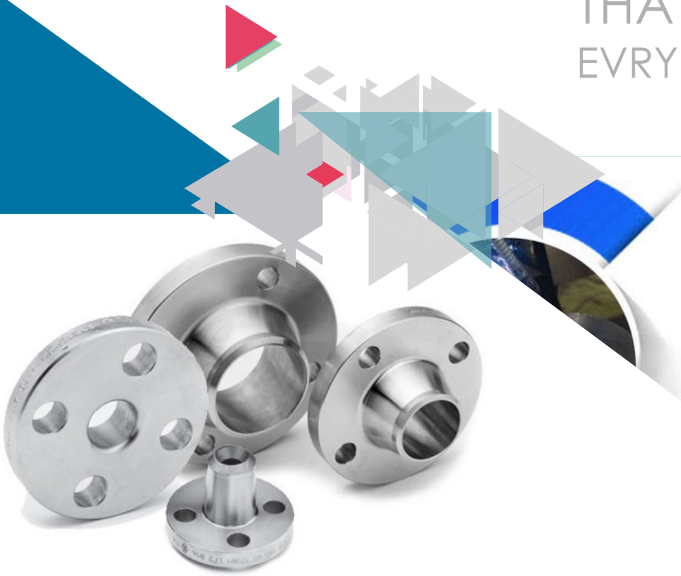
MANDREL MILL PROCESS